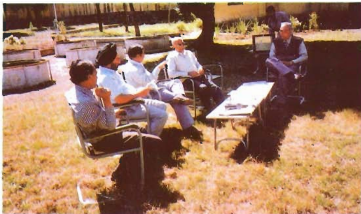
The Chairman & Member QRT in discussion with the Director and other senior officers at the Chirapani Experimental farm