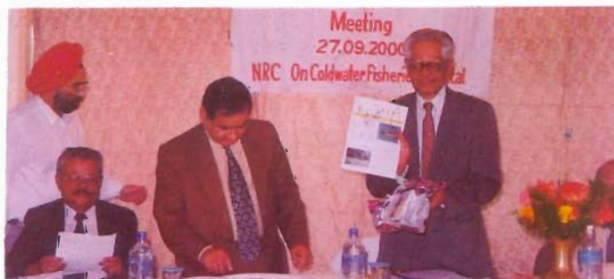
The Chairman RAC releasing a departmental publication.