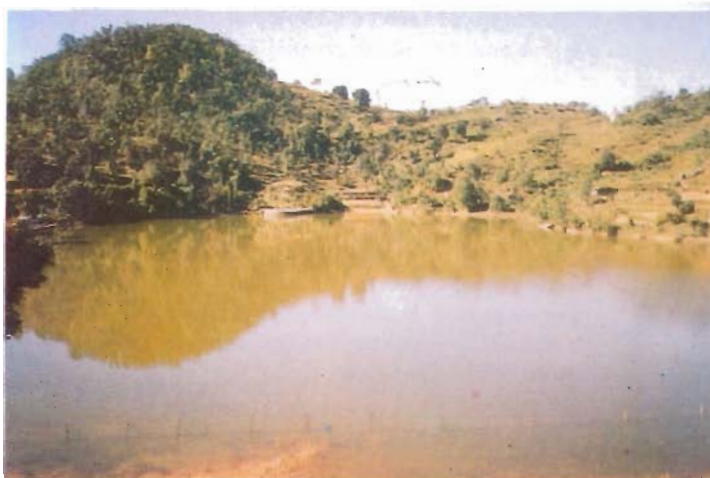
Shyاملatal Lake for Mahseer development

Accordingly after brief survey in the region the Shyاملatal lake was selected for building Mahseer ( Tor putitora ) stock. The lake did not have any prior stocks of mahseer which was confirmed through repeated nettings. The wild fingerlings of mahseer were collected from river Ladhya at Chalthi and river Kosi at Ramnagar, carefully acclimatized and transported to lake site. Prior to stocking the seed was properly conditioned as per the water quality parameters of the lake to avoid any adverse impact on fish stocks. This work was initiated from