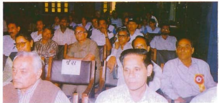
कार्यशाला में उपस्थित जनसमूह

संस्थान में राजभाषा हिन्दी के स्वर्णजयन्ती वर्ष का आयोजन बड़ी धूमधाम से किया गया। इस अवसर पर माह सितम्बर, 2000 में हिन्दी सप्ताह समारोह भी मनाया गया जिसमें निबन्ध प्रतियोगिता, प्रश्नोत्तरी प्रतियोगिता तथा हिन्दी कार्यशाला आदि का आयोजन किया गया। कार्यशाला दिनांक 7 सितम्बर, 2000 को आयोजित की गई जिसमें विभिन्न संस्थानों, सरकारी तथा गैर-सरकारी संगठनों, स्कूल-कालेजों के प्राध्यापकों, अनुसंधानकर्ताओं, जिला पंचायत सदस्यों तथा स्थानीय जनता ने भाग लिया। कार्यशाला का मुख्य उद्देश्य