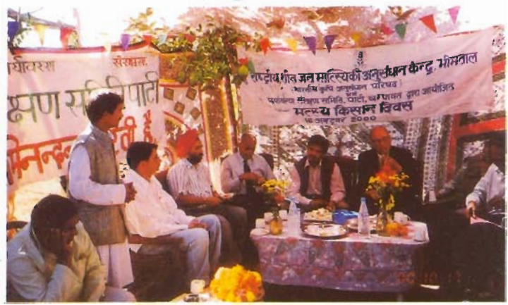
संस्थान द्वारा चम्पावत जिले के पाटी विकासखंड में आयोजित किसान मेला के अवसर पर विशिष्ट अतिथिगण।