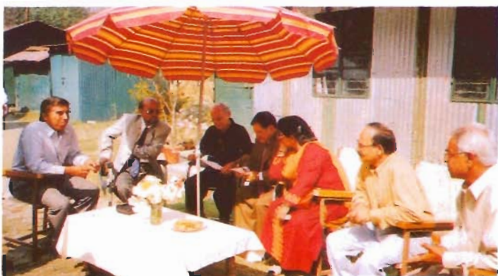
Various Dignitaries and other visitors at NRCCWF and Mahseer hatchery