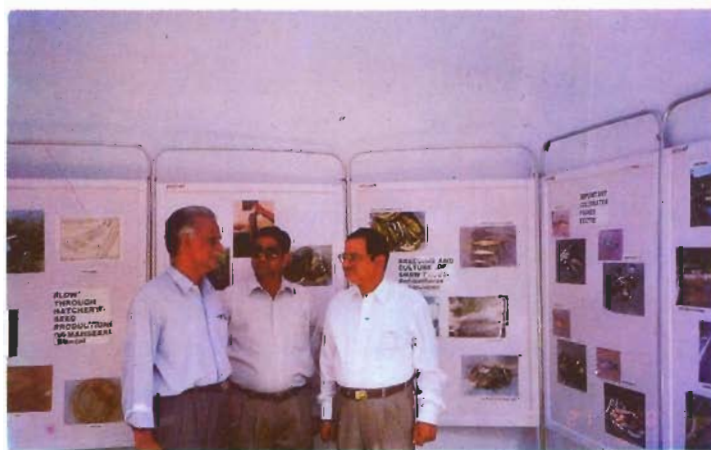
Dr. Gopakumar (DDG) Fy. ICAR being briefed at NRCCWF stall at First Indian Fisheries Congress

stall attracted many dignitaries and Shri Matbar Singh Kandari, Hon’ble Minister, Govt. of Uttaranchal paid a visit to the stall and appreciated the work done by NRCCWF .