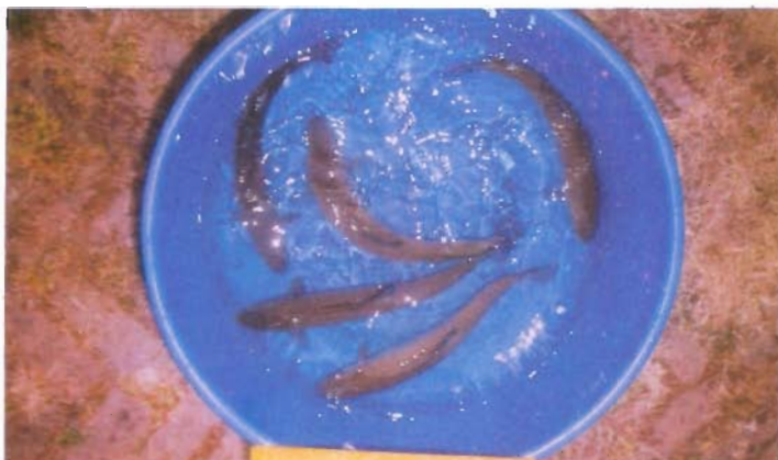
Farm reared Rainbow Trout

The state of Uttaranchal having two distinct regions of Garhwal and Kumaon, have good potential for developing trout. The state has initiated trout farming in Garhwal region which is more suitable for this fish. But hardly any attempt was made to develop its farming in Kumaon region, which is comparatively more warmer and not very conducive for this species.