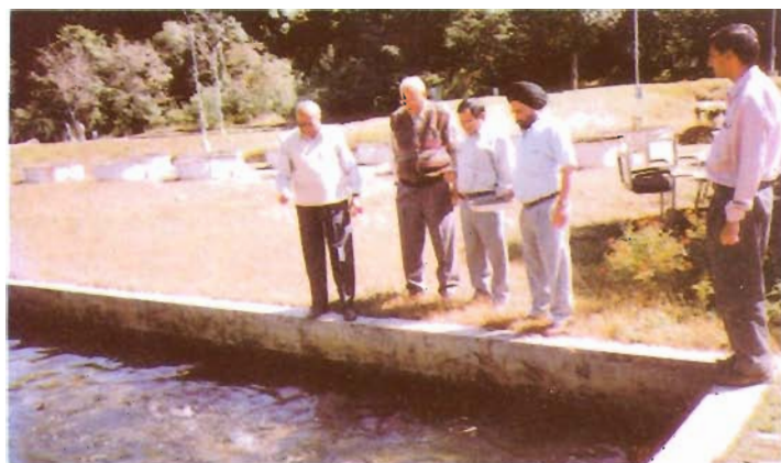
The members inspecting trout stocks at the farm