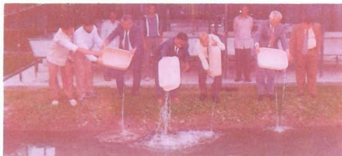
The members of RAC releasing hatchery reared mahseer seed in nursery ponds