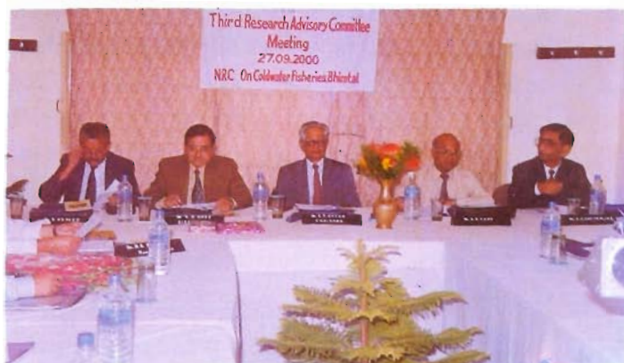
Third Meeting of Research Advisory Committee